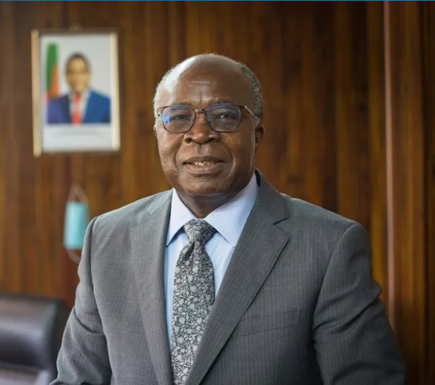
GUEST OF HONOUR Hon. Dr. Situmbeko Musokotwane, MP Minister of Finance and National Planning

The 2025 Pre-AGM Workshop features a distinguished panel of speakers comprising policymakers, financial leaders, and industry experts who will share insights aligned with the theme “Innovating for Growth.” Covering diverse areas such as tax reforms, ESG reporting, the green economy, mental health, and corporate governance, these speakers bring a wealth of experience aimed at equipping delegates with practical knowledge, strategic perspectives, and renewed inspiration for the evolving role of accountants in Zambia’s economic transformation.